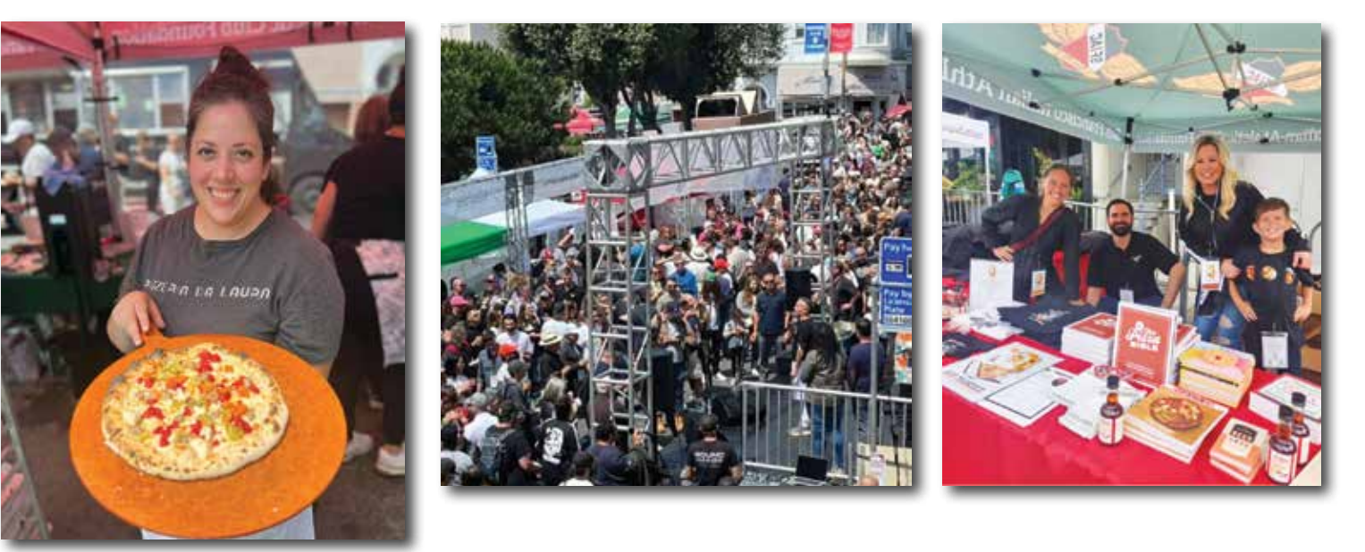
Wonderful to have Tony's alum Chef Laura back in North Beach