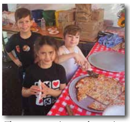
The next generation may be running the show sooner than expected.

The SFIAC Foundation is pleased to announce The 2024 Voyage of Discovery Trip of a Lifetime