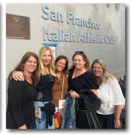
The love of pizza brought these ladies all the way from Southern California