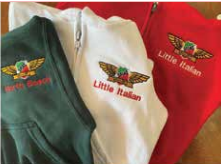
SFIAC Zip Up Hooded Sweatshirts Toddler "Little Italian" 2T-4T in white or red $30 Youth "North Beach" XS-XL in green or white $35