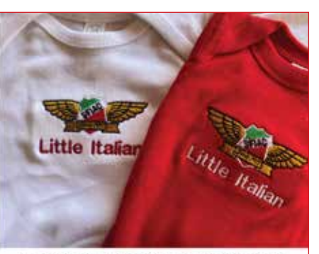
SFIAC "Little Italian" Onesie Newborn to 18 months White or Red $20