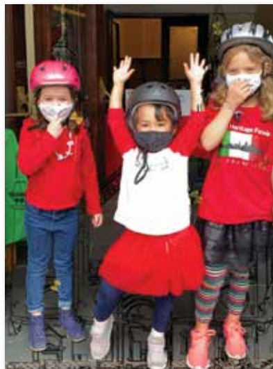
The Club kids had a great time showing their Italian pride.