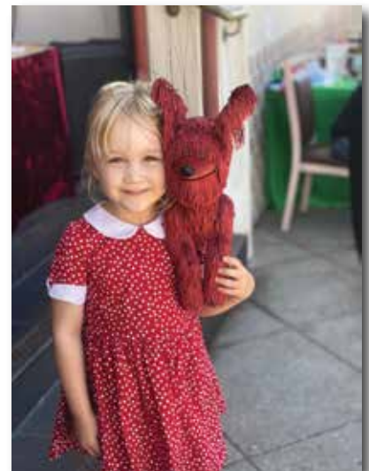
Thank you to the Fratello Marionettes for bringing a smile to all the kids faces.