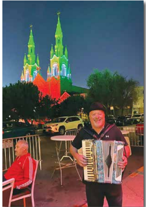
Perfect night with a performance by Rene Sevieri.