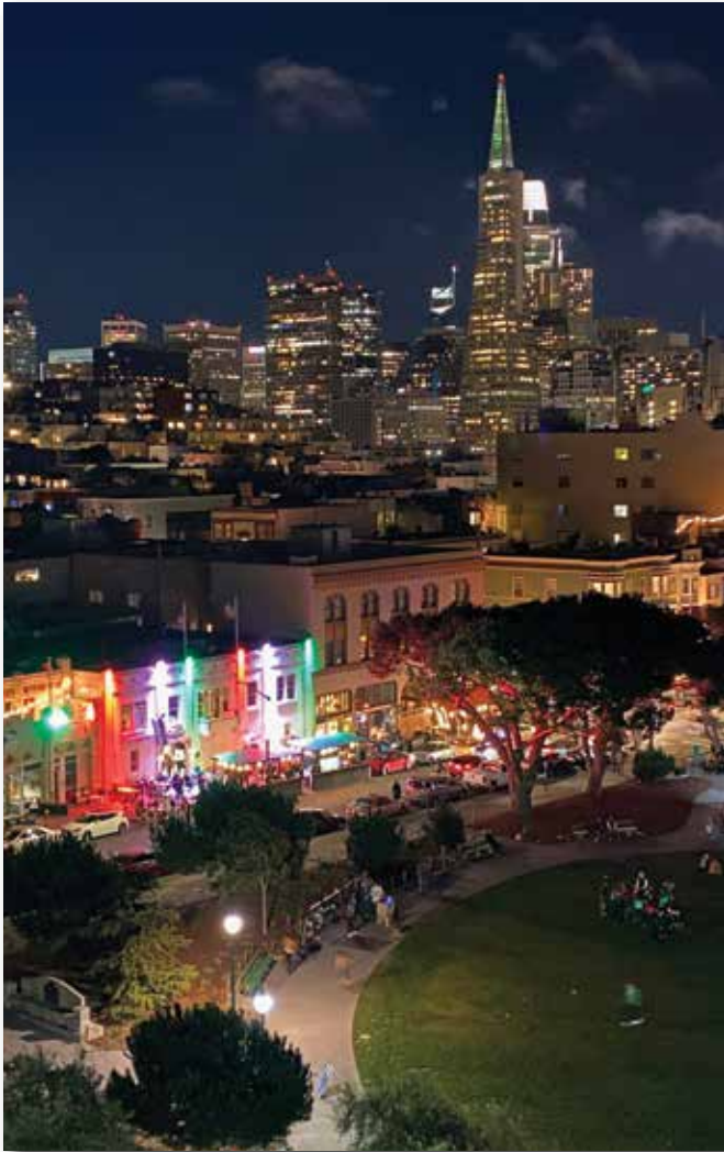
The Club was a centerpiece of the weekend long celebration.

Thank you to everyone that made the 152nd Italian Heritage Parade so special.