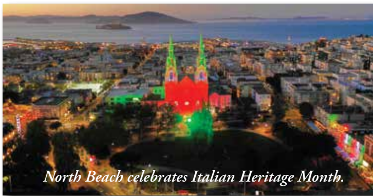
North Beach celebrates Italian Heritage Month.