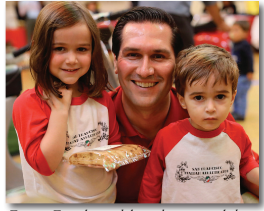
Figone Family modeling their new club tees