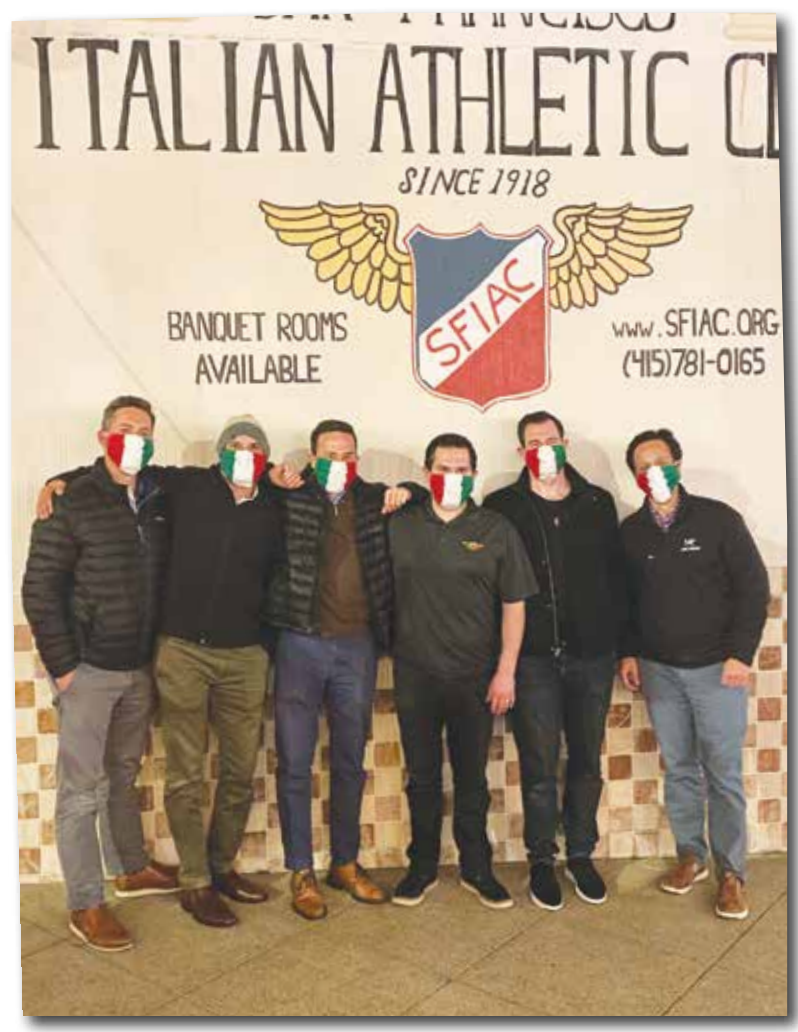
March Stag Night Line Up