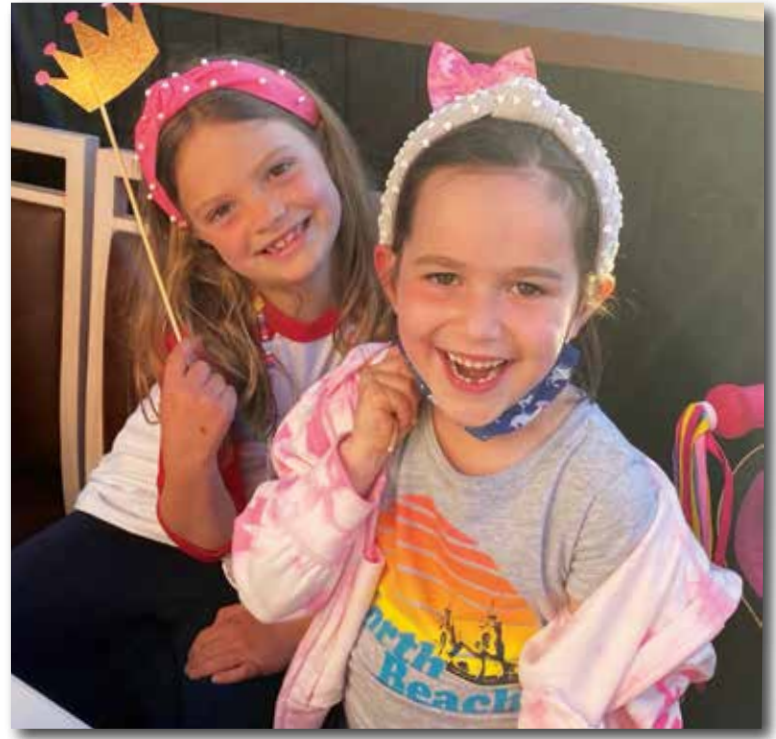
Scooter Gang never misses a weekend at the Porta Via.