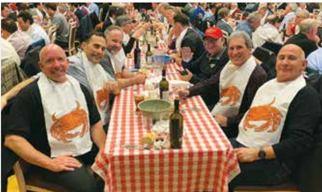
Another full house for Crab Stag.

Tickets MUST be purchased by Friday, May 1.