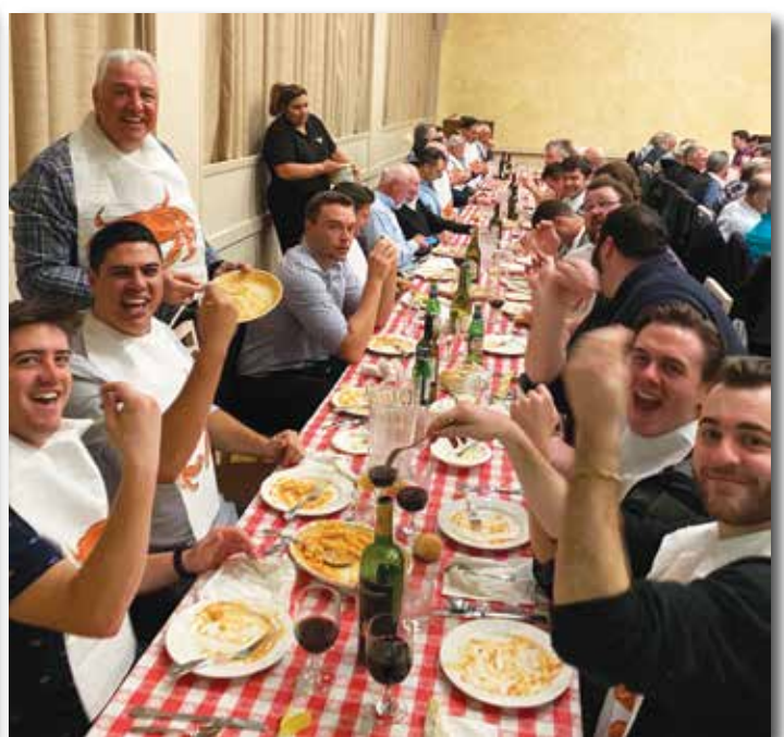
Pretty sure the Padovese group had a great evening of wine and crab.