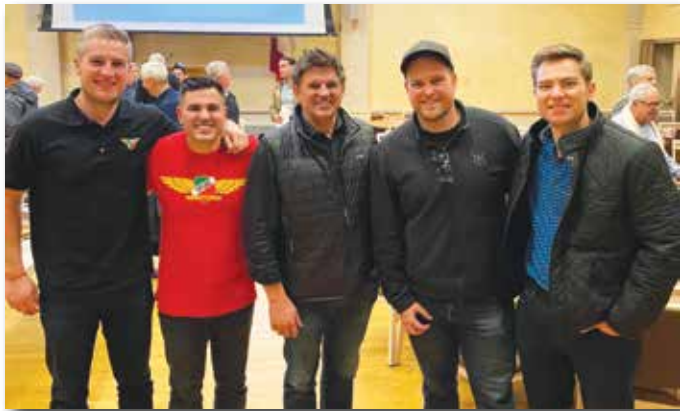
Members of the ever growing Santa Clara contingent.