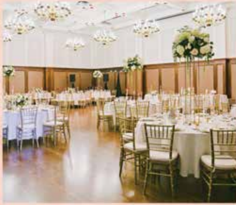
San Francisco Italian Athletic Club