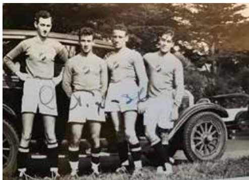
So much history. SFIAC soccer players at the Beach Chalet. Date unknown.