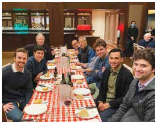
SFIAC soccer players do stag night