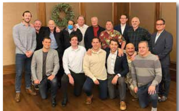
In December, we welcomed sixteen new members.