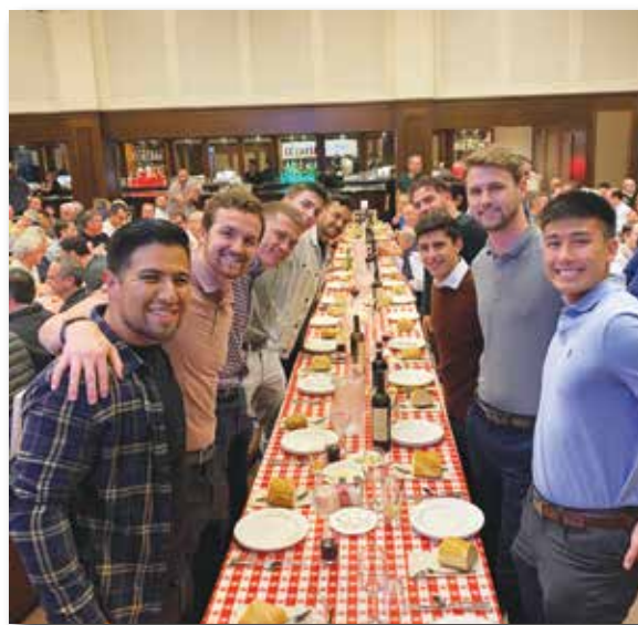
Our soccer team attends stag night.