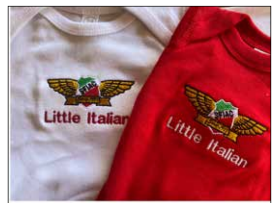
SFIAC "Little Italian" Onesie Newborn to 18 months White or Red $20

email keely@sfiac.org or call Keely 415.523.3110 to order