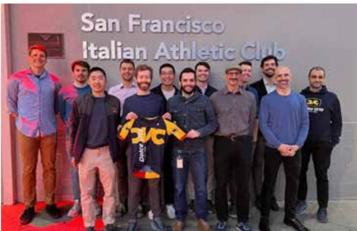
Welcome to the SFIAC-sponsored Dolce Vita cycling team. Five team members have joined the SFIAC. Congratulations on all your success.

Grazie mille to our sponsor ItalFoods. We have ordered additional jerseys for purchase. Stay tuned for their arrival.