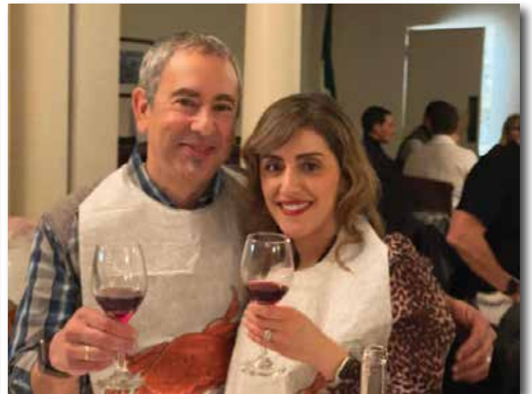
Another wildly successful crab dinner. Grazie mille to all who attended.