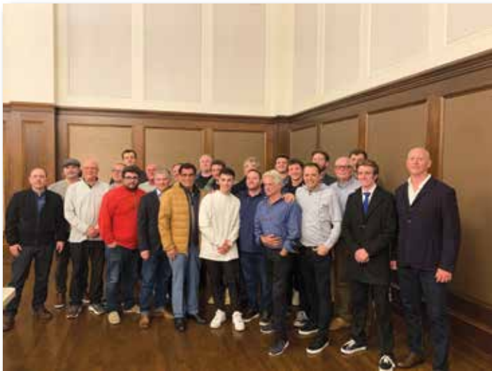
Welcome to our record setting twenty-three new members who joined in February.

You do not need to be an athlete to join.